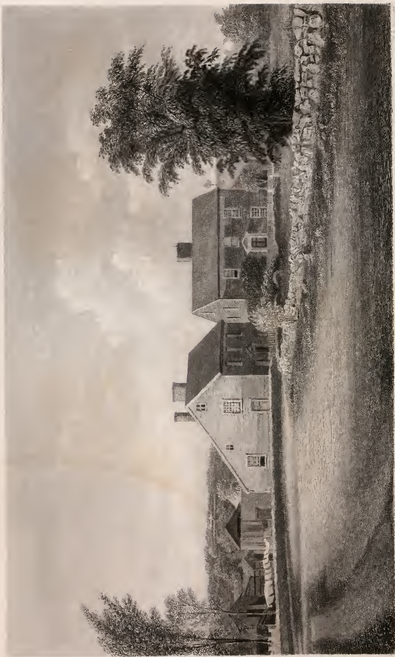
2. The west places of John and of John and Mary Adams