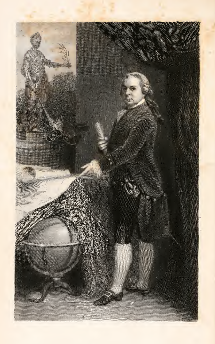
PUBLATER BY TELLES I LITTLE & JAMES BROWN